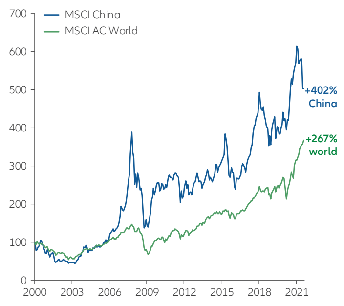
Exhibit 1: MSCI China and MSCI ACWI performance since 2000 (in USD, indexed to 100)

There are many ways for investors to buy shares of Chinese companies. This has become even more important during China's recent regulatory clampdown, which affected some listings – particularly US-listed American depositary receipts (ADRs) and select Hong Kong-listed companies – more than others. With China A-shares constituting almost 70% of China's total market capitalisation size, China's capital markets are much broader and deeper than many investors realise (see Exhibit 2 ).