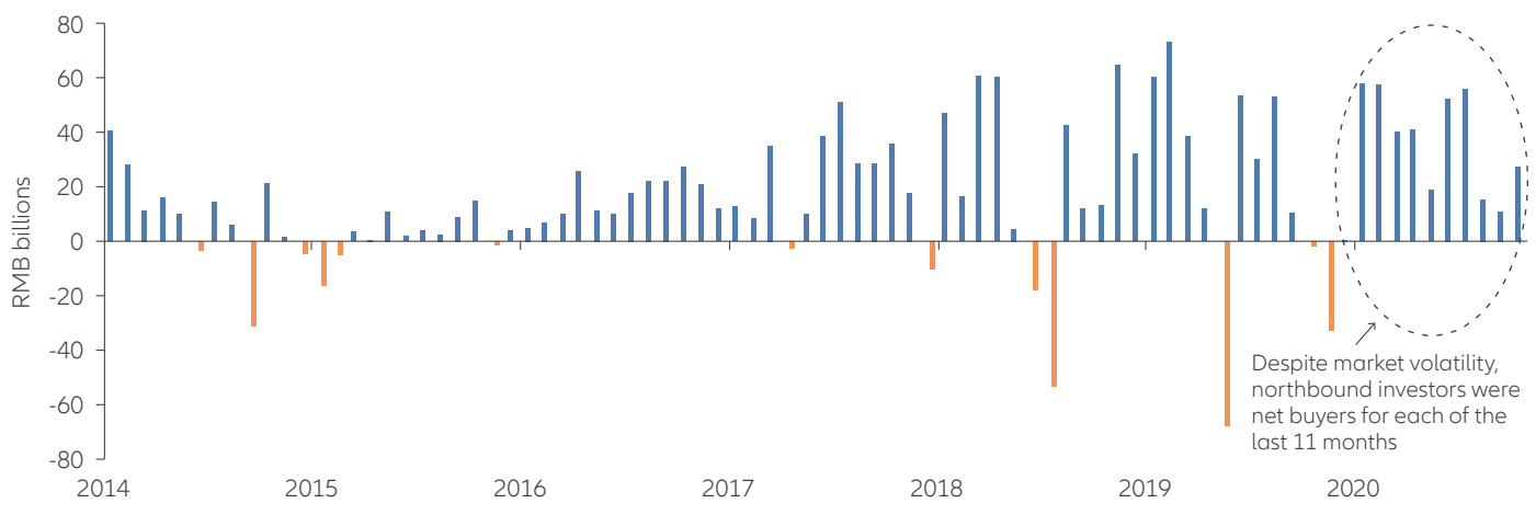
Exhibit 5: monthly northbound net buying via Stock Connect since 2014 (in RMB)

Data as at 31 August 2021.