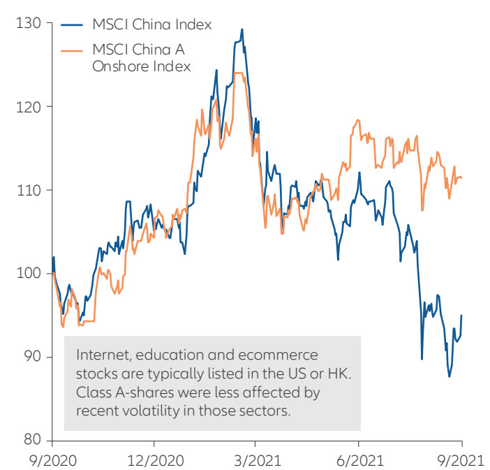
Exhibit 3: MSCI China A Onshore Index vs MSCI China Index performance since September 2020 (in USD, indexed to 100)

Data as at 31 August 2021. Based on total return performance in gross, in USD. Past performance is not indicative of future results.