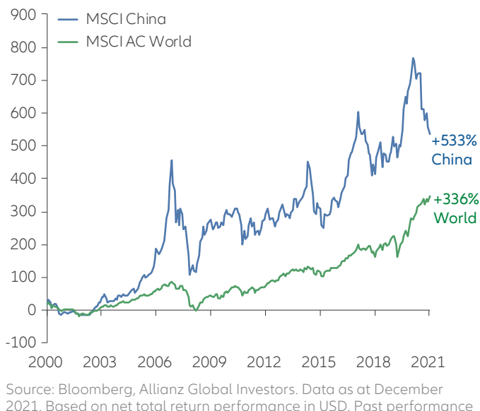
2021. Based on net total return performance in USD. Past performance is not indicative of future results.

MSCI China and MSCI ACWI performance since 2000 (in USD, indexed to 100)